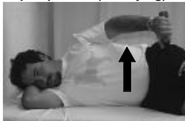
Supraspinatus (Side lying)

Lie on opposite side. Turn thumb toward leg, bring arm forward 30°, keep elbow straight and lift arm from body about 45°.