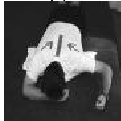
Mid Trap (modified)

Place your upper arm at shoulder level with your *elbow at 90°. Bring your shoulder blade DOWN and IN toward your spine then gently lift your arm off the floor. Keep your hand and elbow at the same level. Do not let your shoulder shrug. *Progress to lifting with your elbow straight.