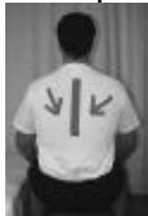
Low Trap Set

While sitting, place your hands in your lap. Bring your shoulder blades DOWN and IN toward your spine. Hold for 2 seconds then relax. Do not let your shoulders shrug.