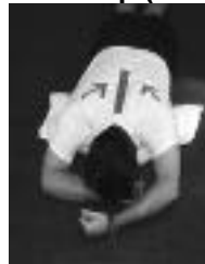
Low Trap (modified)

Place your arms overhead with elbows slightly bent. Bring your shoulder blade DOWN and IN toward your spine, and then gently lift your arm from the floor. Keep your hand and elbow at the same level. Do not let your shoulder shrug.