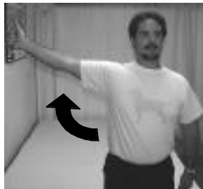
Abduction to 90°

With thumb up, lift arm(s) out to the side up to shoulder level.