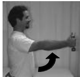
Flexion to 90°

___ With thumb up, ___ With palm down, lift arm(s) forward up to shoulder level.