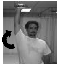
Abduction Full ROM

With thumb up, lift arm(s) out to the side up toward the ear.