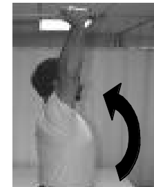
Flexion Full ROM

With thumb up, lift arm(s) forward up toward the ear.