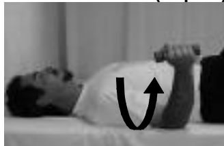
Internal Rotation (Supine)

Lie on your back with knees bent. Keep elbow at your side and bent to 90°. Lower hand out to the side and bring back across the stomach.